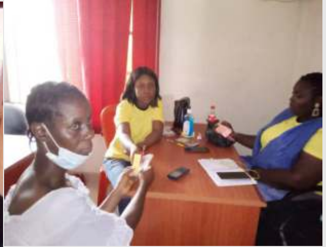
Cash transfers to vulnerable families in Cross River State for Household Economic strengthening by Centers for Clinical Care and Research in Nigeria(CCCRN)