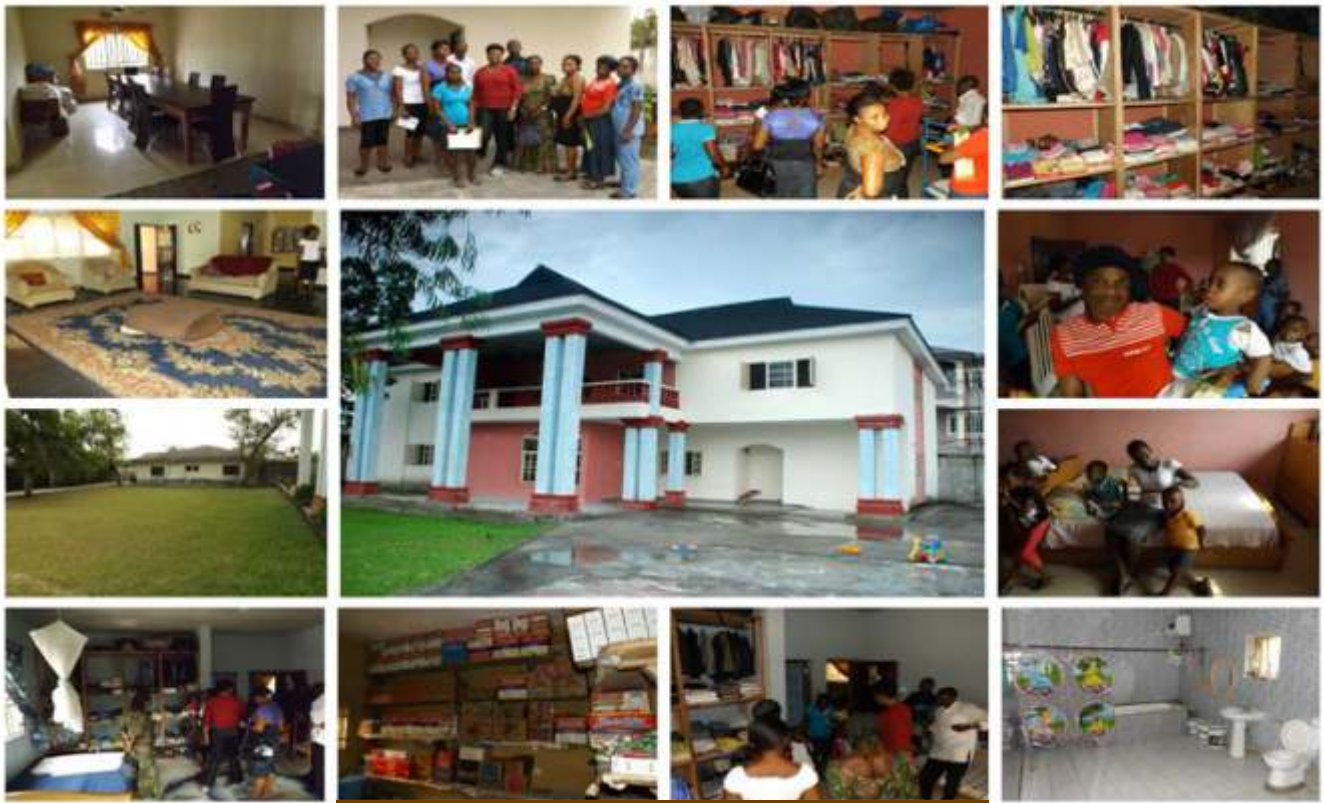
Our current facility