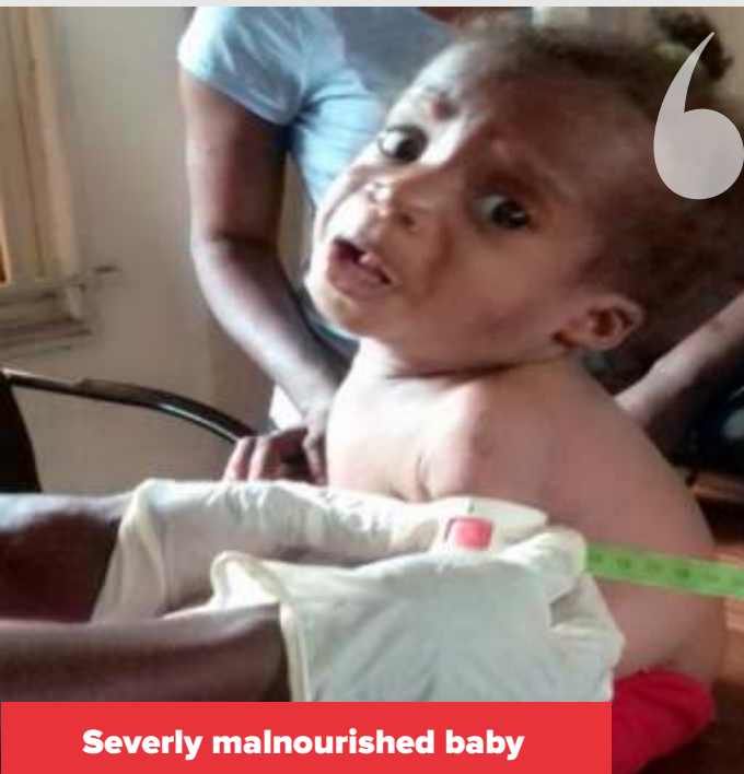
Severly malnourished baby

“ Hard Facts An estimated 2 million children in Nigeria suffer from severe acute malnutrition (SAM), but only two out of every 10 children affected is currently reached with treatment.