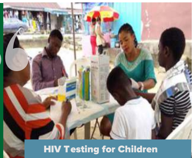
HIV Testing for Children

“ Hard Facts HIV alone accounts for 14.0% of childhood mortality